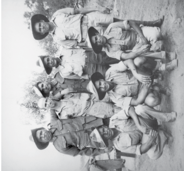
Indigenous Australians at War from the Boer War to the Present